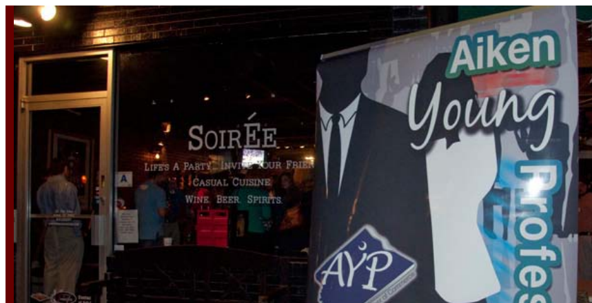
AYP banner displayed outside Soiree, located in The Alley off Laurens St. in downtown Aiken.

The offer gives AYP members an opportunity to enjoy unique tastes and local food at Aiken's newest casual dining spot.